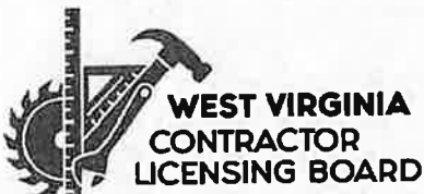
Chair, West Virginia Contractor Licensing Board

A copy of this license must be readily available for inspection by the Board on every job site where contracting work is being performed. This license number must appear in all advertisements, on all bid submissions, and on all fully executed and binding contracts. This license is non-transferable. This license is being issued under the provisions of West Virginia Code, Chapter 30, Article 42.