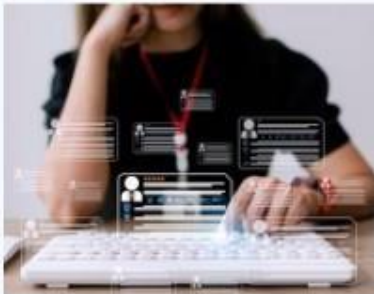
Client & Candidate Connection We facilitate the assessment of mutual compatibility.