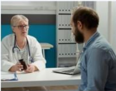
Consultation We deeply evaluate your staffing needs.