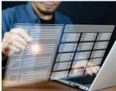
Screening & Selection Through extensive assessments, we ensure a perfect match.