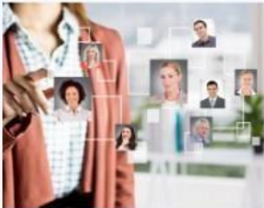
Talent Search We accurately match candidates to your requirements.