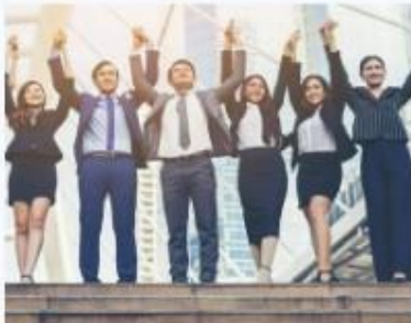
Successful Placement We handle all the paperwork and onboarding, ensuring a seamless transition.