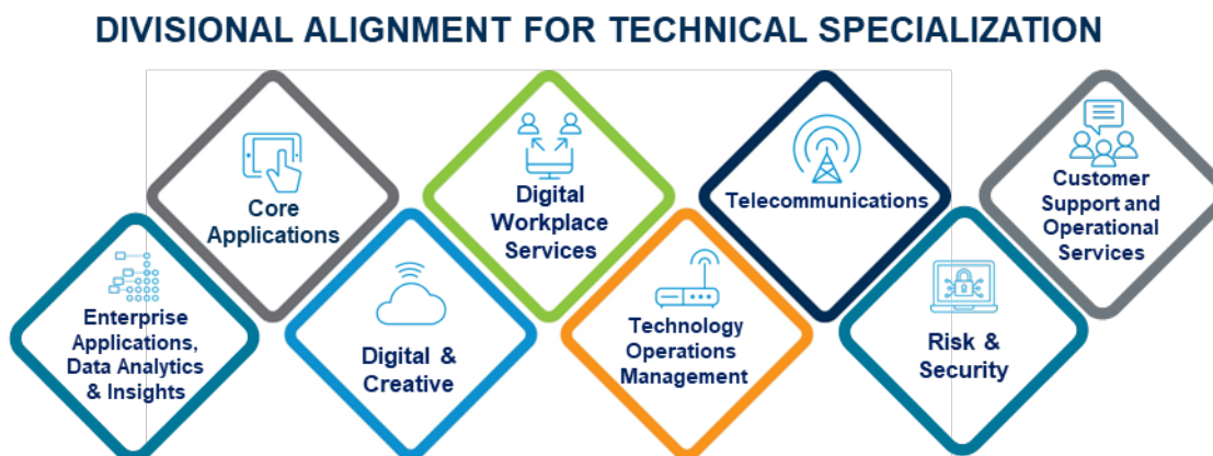
Figure 3. Skill Set Expertise

Our technical divisions align with your requested job classifications and include the following: