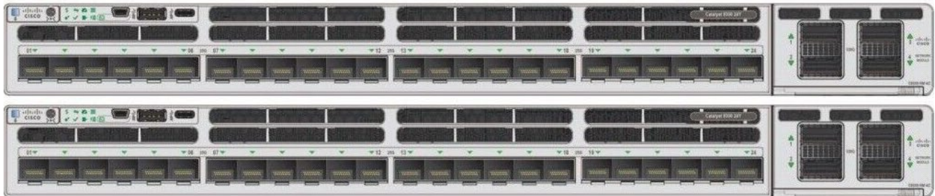
Figure 3 – 2x Cisco Catalyst 9300X-24Y Switch