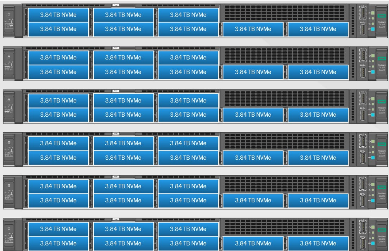
Figure 1 – 6x HPE DL325 Gen11 Servers