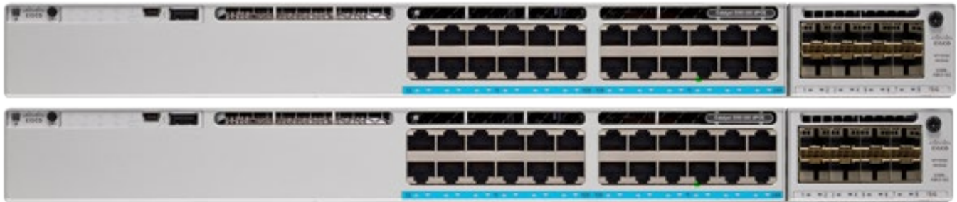
Figure 4 – 2x Cisco Catalyst 9300-24T Switch