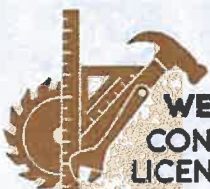
Chair, West Virginia Contractor Licensing Board

WEST VIRGINIA CONTRACTOR LICENSING BOARD