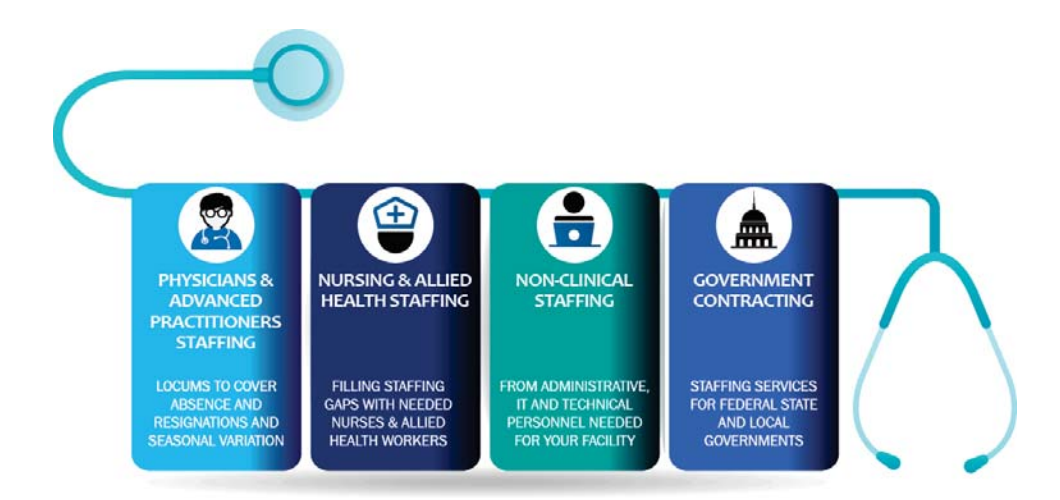
Figure 1: Our Services

Adelphi's recruitment and contract management expertise have helped us meet our clients' objectives thanks to consumer feedback. Our customer-centric attitude ensures that we can fulfill our client's recruitment requirements. As Adelphi strives to become the leading provider of staffing services in the US, it would be an honor to partner with your institution to meet its staffing needs.