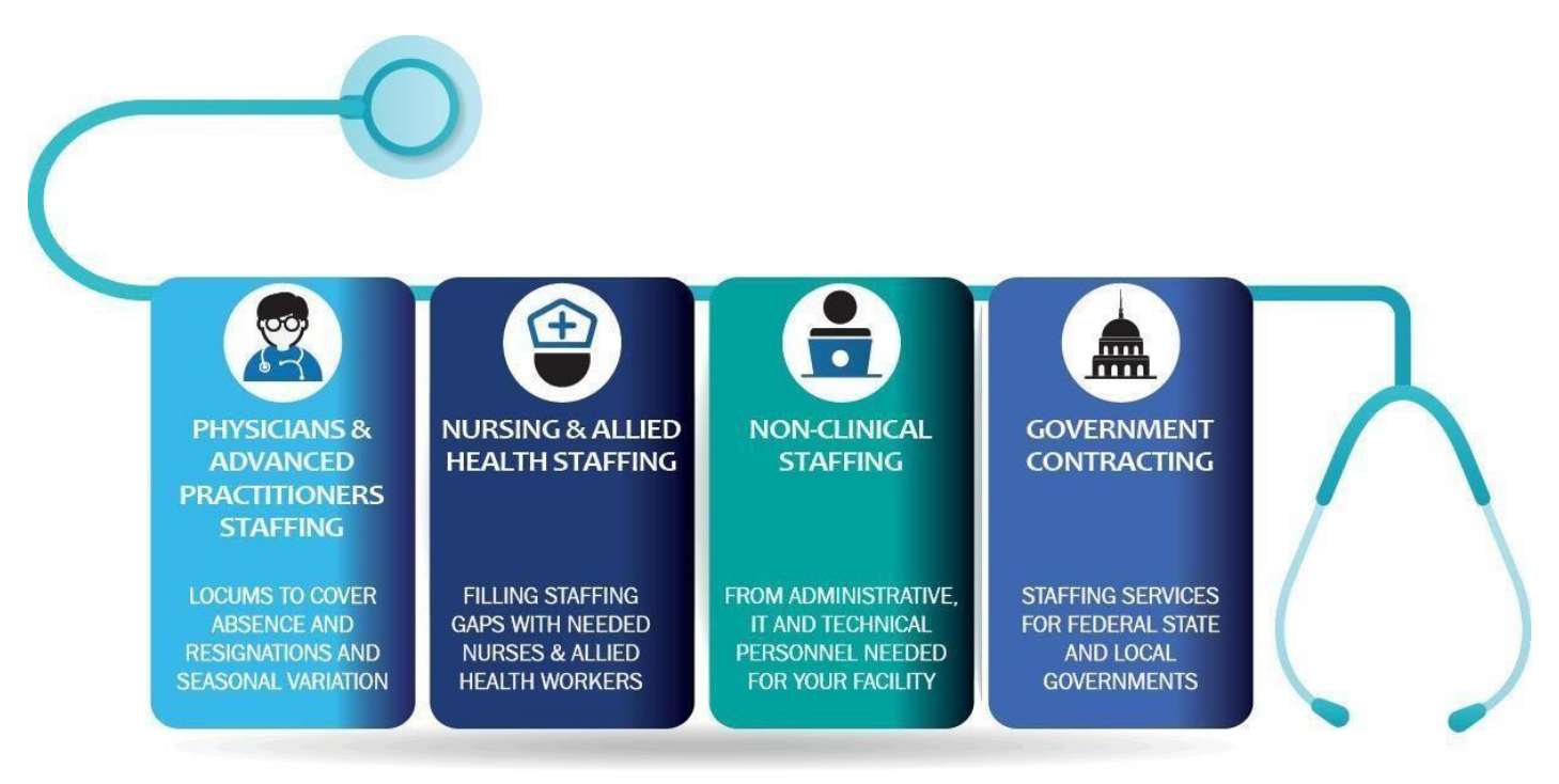
Figure 1. Our Services