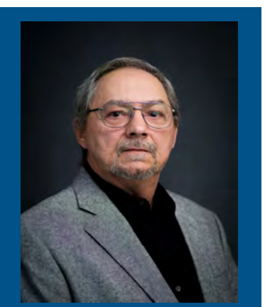
EDUCATION Woodson School of Surveying