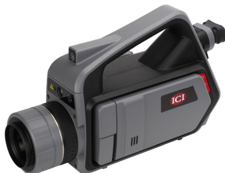
Gas DetectIR VOC Gen 2

Numerous industries engage extensively with methane, organic gases, and chemical compounds. The potential harm to both life and the environment arising from the release of volatile organic compounds and flammable toxic gases has become a matter of global concern. ICI's Gas DetectIR VOC Gen 2 swiftly visualizes and locates gas leaks, making it a critical asset for detecting latent faults and mitigating exposure to potentially hazardous chemicals. Notably, the device holds ATEX certification, ensuring its adherence to explosion-proof standards.