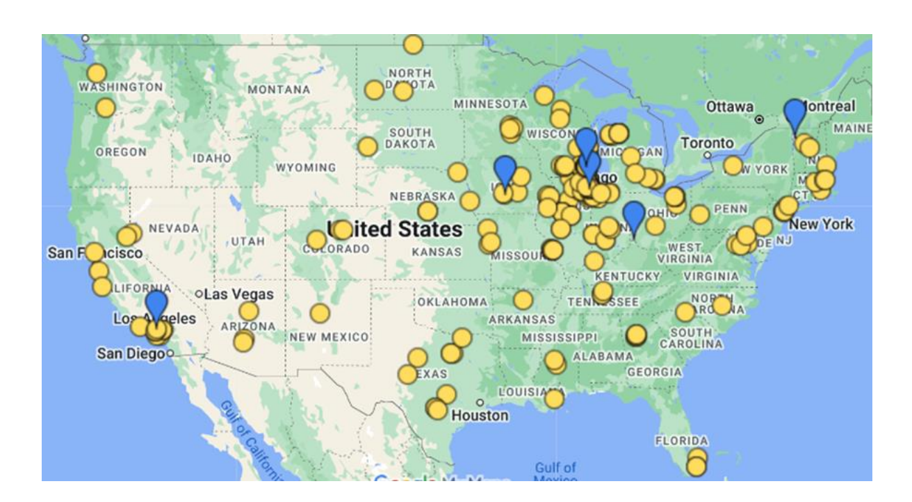
TW&B is Chicago-based and serves clients nationwide.

We believe the best way to demonstrate our success in client service is to reach out to our references. By connecting with other non-profit professionals who have shared the same goals and had the same challenges, you can learn firsthand how TW&B has helped similar organizations advance.