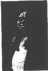
Senior Manager Licensed Pennsylvania CPA

Contact 412.535.5510 dhandshue@md-cpas.com