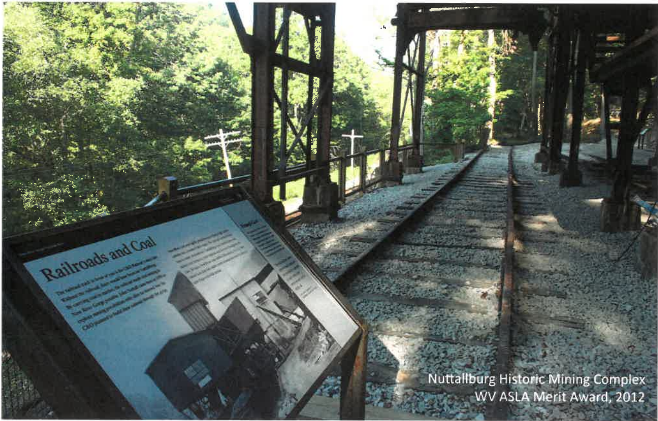
Nuttallburg Historic Mining Complex WV ASLA Merit Award, 2012