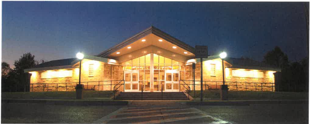
American Institute of Architects, Merit Award, 2010