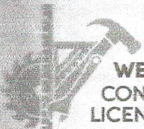
Chair, West Virginia Contractor Licensing Board

WEST VIRGINIA CONTRACTOR LICENSING BOARD