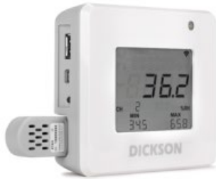
Display Data Logger