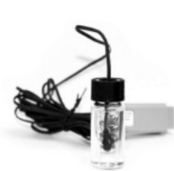
Probe in Glycol