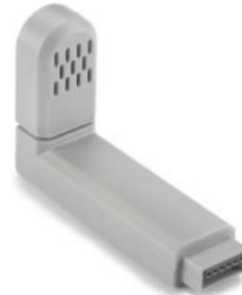
Temperature/Humidity Probe (Ambient Probe similar in style)