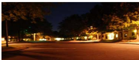
250w HPS (296w) VS