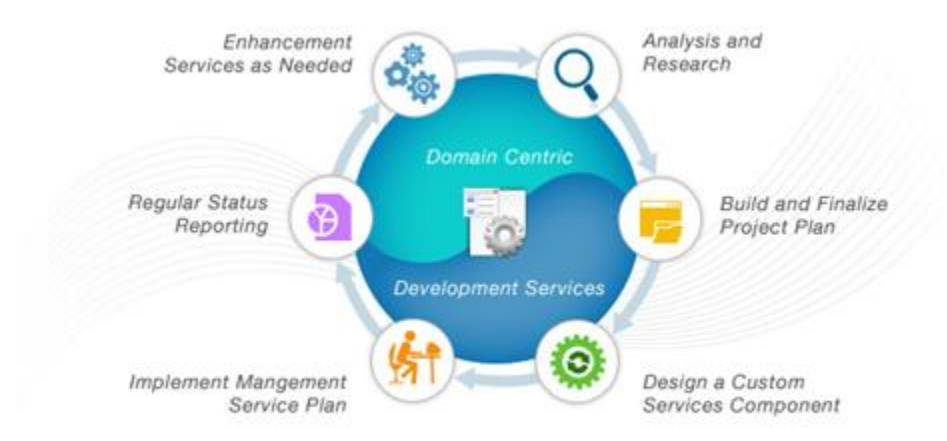
Application Management Services