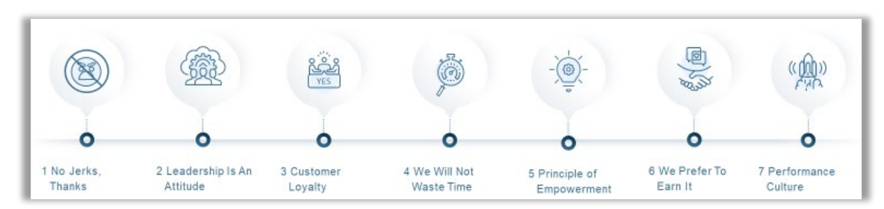
Figure 1. VSO First Principles

VSO has built a valuable company by building a company of values. The image below shows VSO's 7 First Principles which the company uses to measure all our work. More information on our First Principles can be found on our website at <a href="www.vso-inc.com/about">www.vso-inc.com/about</a>.