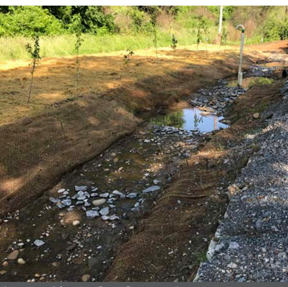
Impacted Stream Post Construction