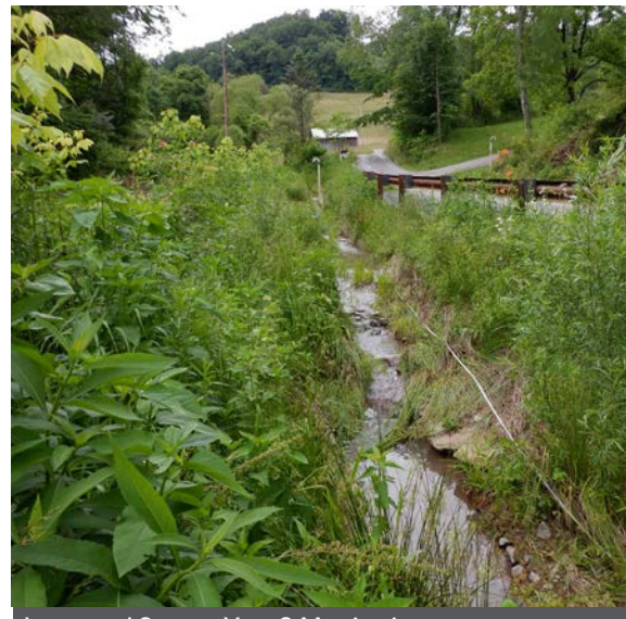
Impacted Stream Year 2 Monitoring