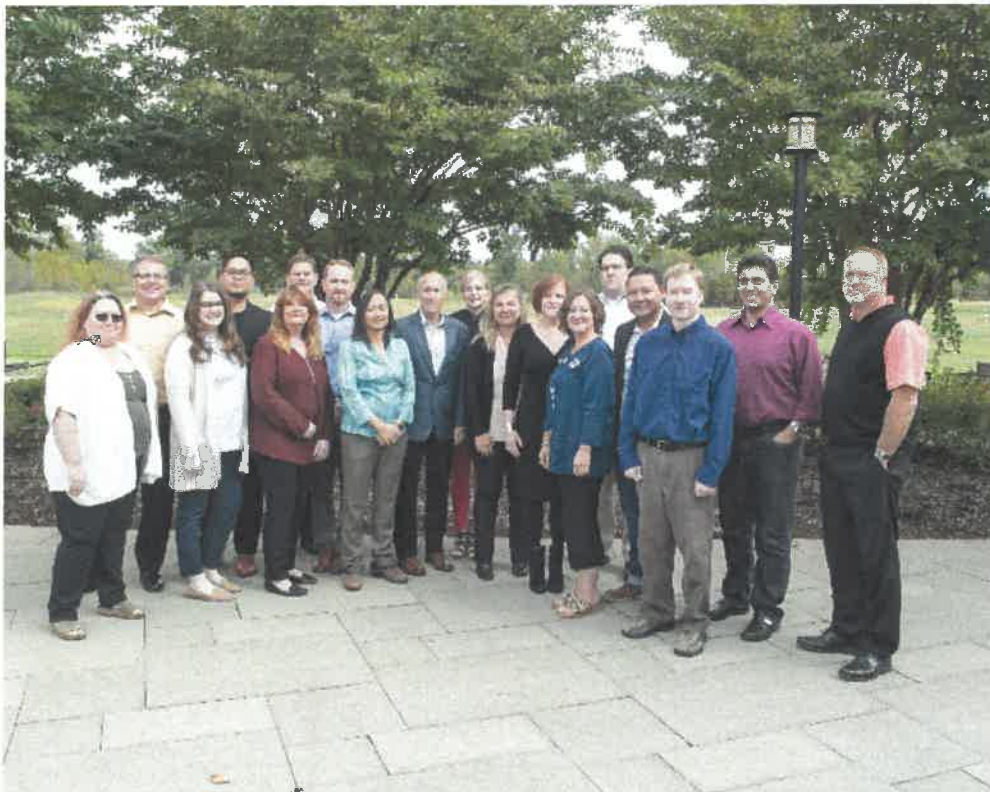
Our Chantilly Virginia-based team is anxious to help the State succeed

We are confident in the estimated costs contained within our proposal due to our experience delivering similar solutions to government clients of all sizes. We have significant experience working with state fleets in delivering this technology to help facilities and fleet managers manage right-size their geographically dispersed fleet of vehicles. We are the recognized industry leader providing vehicle sharing technology with fully integrated electric key systems. We authored The Ultimate Guide to Fleet Utilization that is endorsed by the National Association of Fleet Administrators (NAFA). FleetCommander is used nationwide by federal, state, and local governments to manage vehicle utilization, collect and report on vehicle high/low mileage, management maintenance, and more.