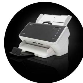
Alaris S2040/S2070 Scanners