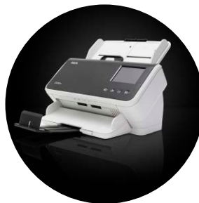
Alaris S2060w/S2080w Scanners