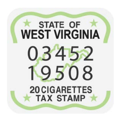
Figure 1. West Virginia Cigarette Tax Stamp Design Sample