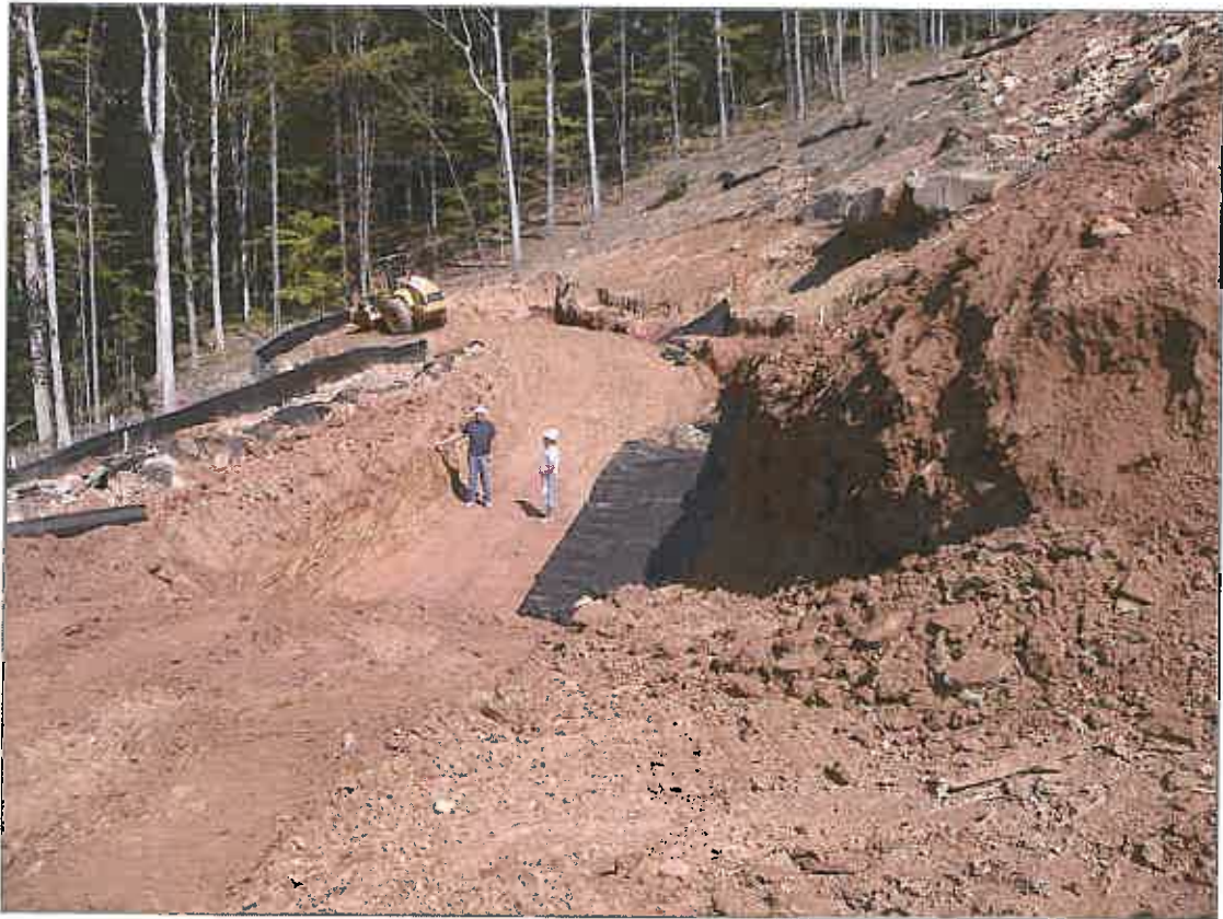
Embankment Fill Keyway for Impoundment Site in Doddridge County, WV