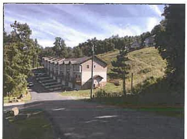
Finished Apartment Site