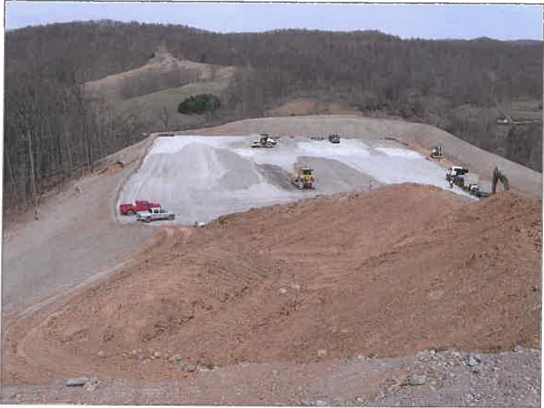
Drill Pad Site in Doddridge County, WV