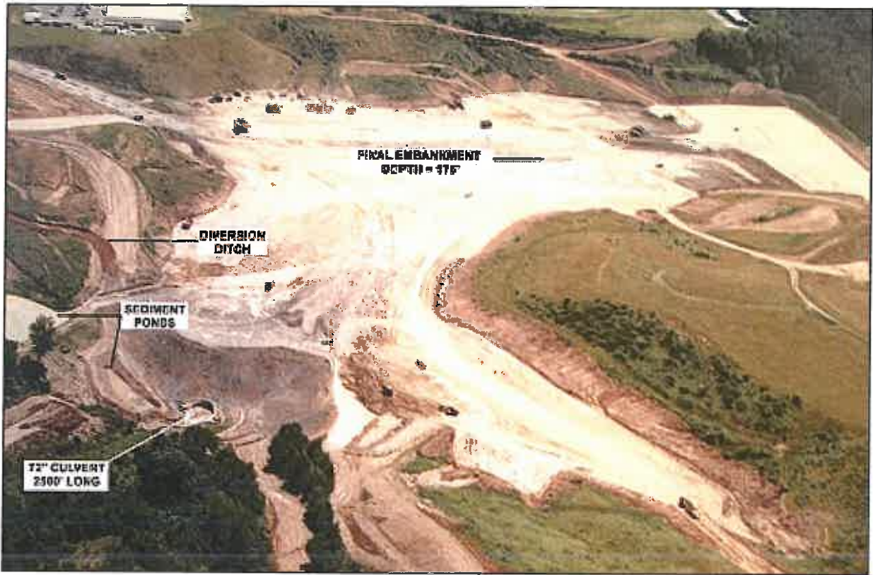
BENEDUM AIRPORT RUNWAY EXTENSION PROJECT