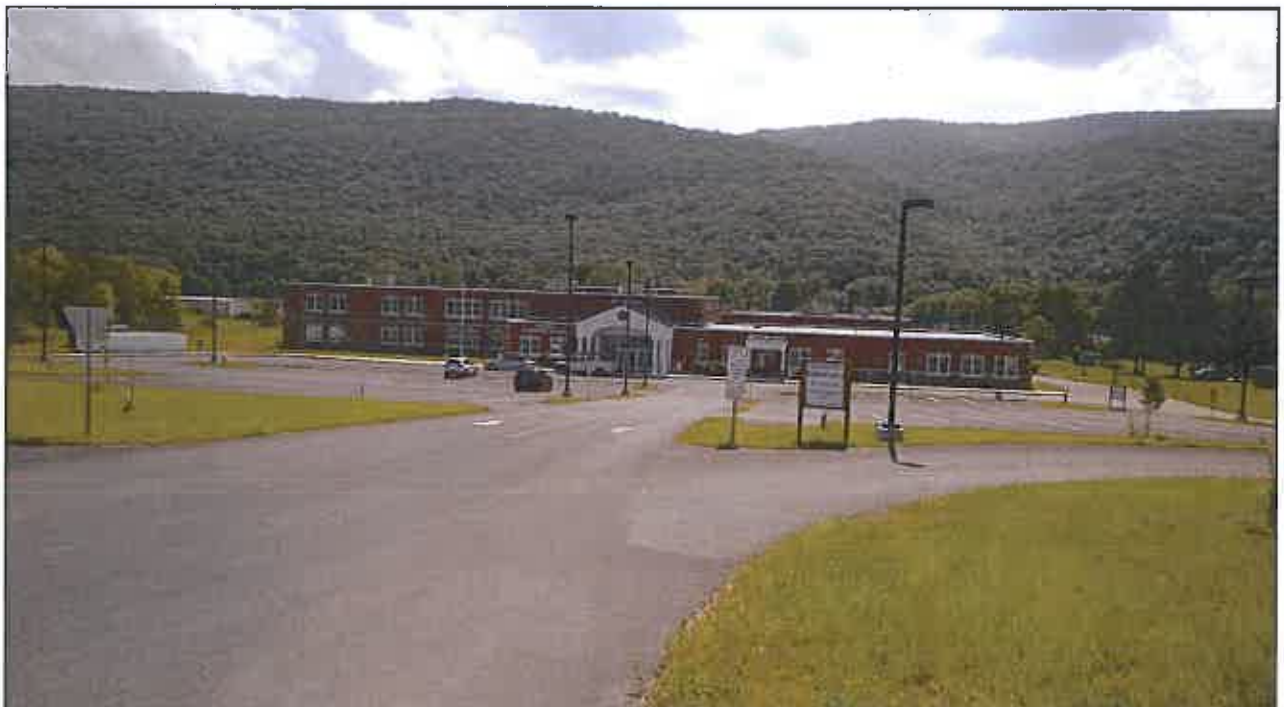
Below: Finished school and site