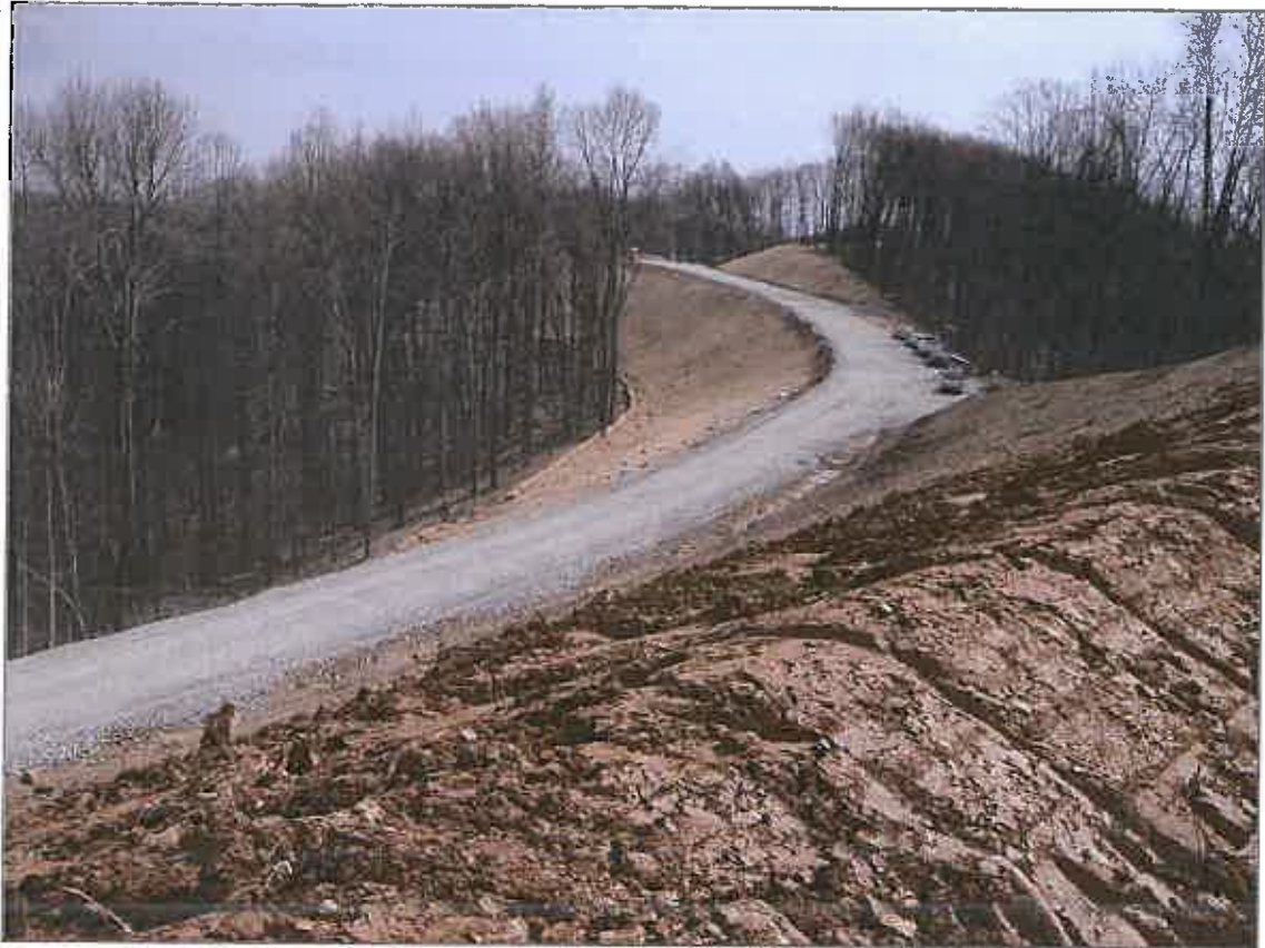
New Access Road to Well Site in Doddridge County, WV