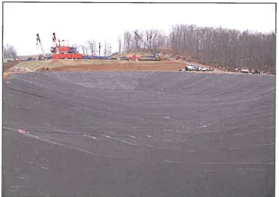
Lined Frac Pit and Drill Pad Site, Ritchie County, WV