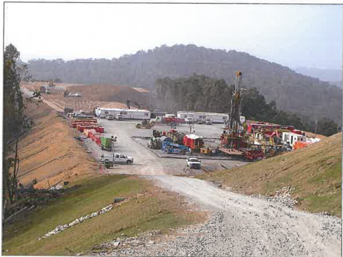
Access Road and Operating Drill Pad in Wetzel County