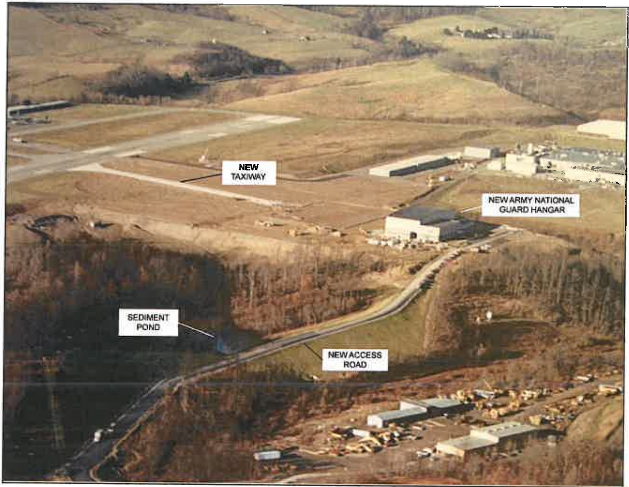
EASTERN ARNG FIXED WING TRAINING SITE AT BENEDUM AIRPORT