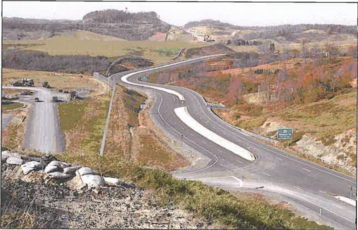
ROUTE 279, NORTH BRIDGEPORT BYPASS