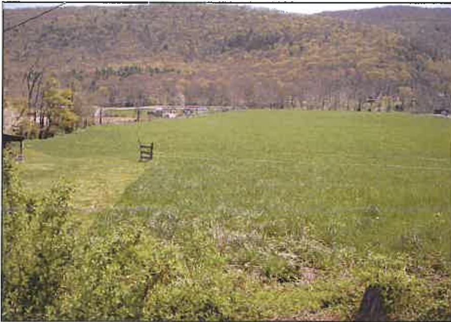
Left: Undisturbed six (6) acre project site

Hornor Brothers Engineers was part of the consultant team retained by the Pendleton County Board of Education to evaluate site selection and develop the project criteria for one of the first design-build new schools in West Virginia. Our role focused on the site criteria development portion of the project, including NPDES permitting.