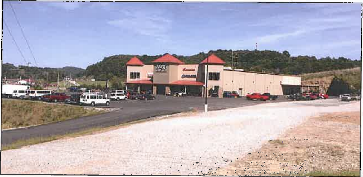
Site and Building Near Completion

Hornor Brothers Engineers worked with the owner of R.G. Motorsports, who desired to enlarge and relocate his business closer to I-79 near Bridgeport, WV. HBE performed all of the mapping and related surveying, as well as the conceptual site design, sanitary sewer service with lift station, and water distribution system.