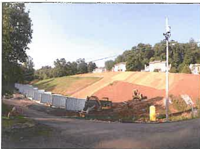
Initial Site Development

Located near Deegan Lake near Bridgeport, WV, the Timberbrook Apartment Complex features ten apartments with lake views. Honor Brothers Engineers' services for the developer included coordination with the building architect, mapping of the property and all related surveying and construction stakeout. Design services included various conceptual plans, earthwork, permitting, access, drainage, and water and sanitary sewer extensions.