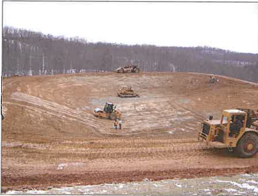
Frac Pit Site Preparation, Ritchie County, WV

The firm also provides periodic on-site project representation during construction to monitor the work as it relates to the design drawings, as well as site surveying services and courthouse deed research. Clients in this area of industrial site development include EQT, Antero Resources and PDC Mountaineer. The following photographs reflect different representative sites at various stages of development.