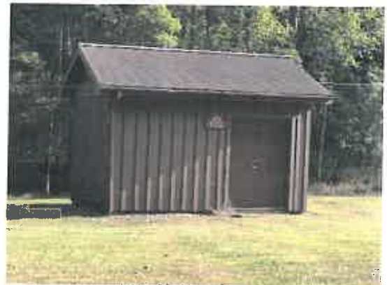
Chief Logan State Park

Chief Logan State Park, located in Logan County, operates and maintains two separate water distribution systems that consist of PVC pipe, booster stations, and storage facilities. Water is supplied by Logan County PSD. The distribution systems are antiquated and failing. Portions of the distribution systems are located in high-traffic areas which has resulted in lines being crushed, most noticeably in the amphitheatre parking lot. These lines should be rerouted. In addition, a portion of the distribution system is exposed in creek beds.