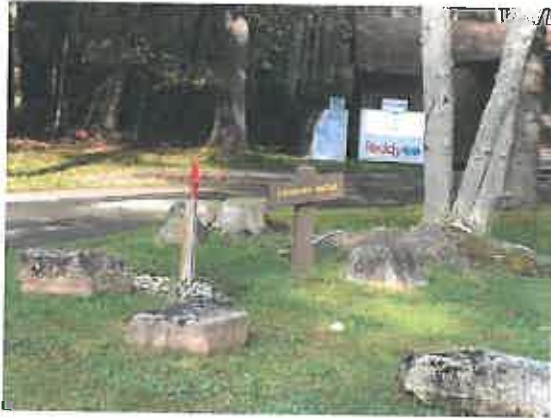
Watoga State Park

Watoga State Park, located in Pocahontas County, maintains water treatment and distribution systems served by multiple wells. The distribution system in some areas of the Park is antiquated and failing. Leaks result in low pressure and water loss. Of particular concern are the Bucks Run Cabin Area, the Pine Run Cabin Area and the Beaver Creek Campground area, all located in the eastern portion of the Park.