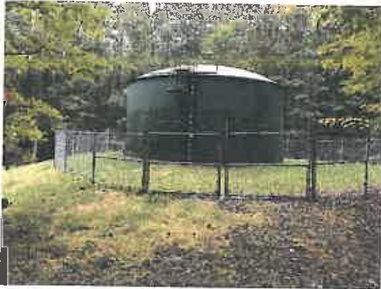
Babcock State Park

Babcock State Park, located in Fayette County, maintains two separate water distribution systems that consist of ductile iron pipe and a steel storage tank. Water is supplied by Danese PSD, located eight miles from the Park. The distribution system is antiquated and failing, often having low pressure issues due to leaks.