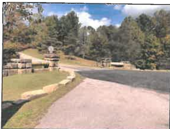
North Bend State Park

North Bend State Park, located in Ritchie County, maintains multiple water treatment and distribution systems. Water is drawn from multiple wells located within the Park. The distribution systems are antiquated and need to be replaced, especially the waterlines to the cabin area and the lodge/pool. A waterline crossing of the North Fork of the Hughes River, necessary to serve the cabin area, will be a challenge.