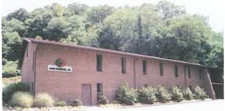
Dunn Engineers, Inc. is located directly across the Kanawha River from the West Virginia State Capitol Complex.

Dunn Engineers, Inc. is a West Virginia based consulting engineering firm that was established in 1975. Since its formation, our firm has been involved in a wide variety of municipal projects, which have enabled our personnel to obtain the breadth and depth of experience needed to meet and exceed the expectations of our clients. Dunn Engineers, Inc. is ready to provide the West Virginia Department of Natural Resources (DNR) with all engineering expertise required for these projects.