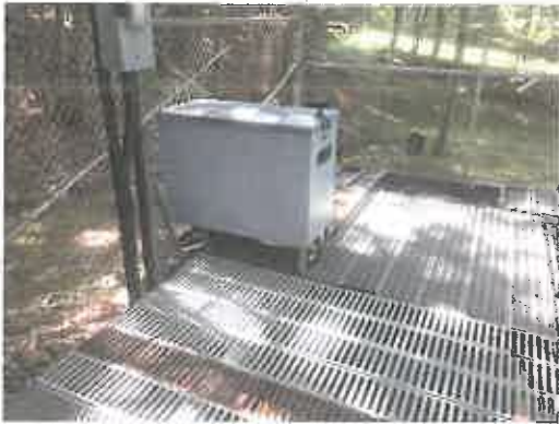
Some of the wastewater treatment facilities at Pipestem Resort State Park.