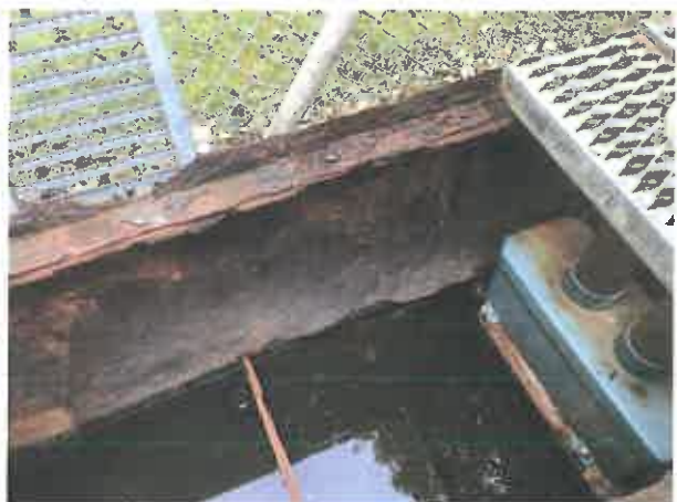
Dunn Engineers Inc. visited Pipestem Resort State Park's wastewater treatment facilities at both the Tram and Bench locations in 2016. Photos represent observations at Bench (above) and Tram (below).