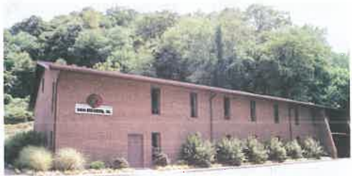
Dunn Engineers, Inc. is located directly across the Kanawha River from the West Virginia State Capitol Complex.

Dunn Engineers, Inc. is a West Virginia based consulting engineering firm that was established in 1975. Since its formation, our firm has been involved in a wide variety of municipal projects, which have enabled our personnel to obtain the breadth and depth of experience needed to meet and exceed the expectations of our clients. Dunn Engineers, Inc. is ready to provide the West Virginia Department of Natural Resources (DNR) with all engineering expertise required for these projects.