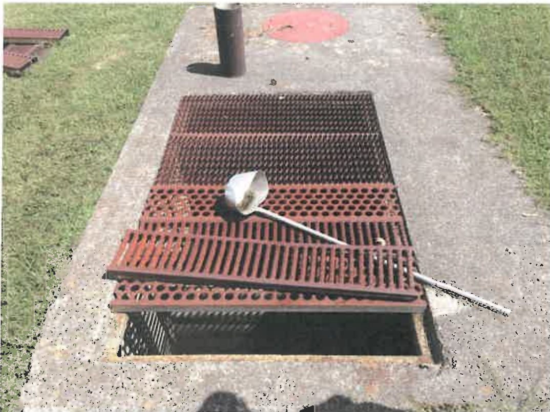
Wastewater Treatment Facilities at Cass Scenic Railroad State Park Photo by Dunn Engineers, Inc. 2016 for Report to DNR See APPENDIX C

3.1.c. History of Projects that met time allotments (Performance Data shown after Proposed Method of Approach)