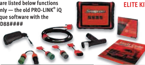
PRO-LINK® ULTRA ELITE KIT

*PLEASE NOTE: The software listed below functions with this PRO-LINK® Ultra only — the old PRO-LINK® iQ EEHD188001 has unique software with the prefix EEHD88####