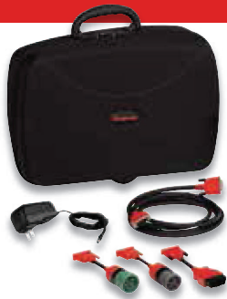
PRO-LINK® ULTRA STARTER KIT