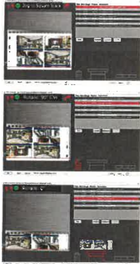
VRCut Controller Screens

©2018 Lytrod Software, Inc. All rights reserved. Unauthorized duplication is a violation of applicable law. Lytrod Software, the Lytrod logo and the VRCut logo are registered trademarks of Lytrod Software, Inc. MBM logo is a registered trademark of MBM corporation.