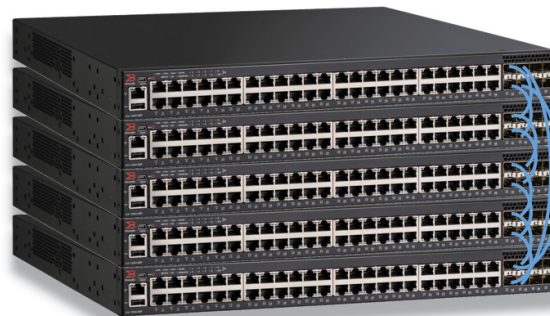
Figure 1: Up to 12 Brocade ICX 7250 Switches can be stacked together using up to four full-duplex SFP+ 10 Gbps ports for a fully redundant backplane with 80 Gbps of stacking bandwidth.

These powerful deployments deliver equivalent or better functionality than large, rigid modular chassis systems, but with significantly lower costs and smaller carbon footprints.