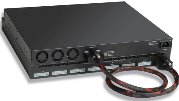
Figure 4: Rear view of the Brocade ICX-EPS 4000 connectivity.

In addition to stack-level high availability, Brocade ICX 7250 Switches also offer an external power supply for failover resiliency, as well as increased PoE/PoE+ port availability.