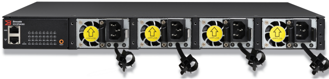
Figure 3: Brocade ICX-EPS 4000 for the Brocade ICX 7250, shown with four AC power supplies.