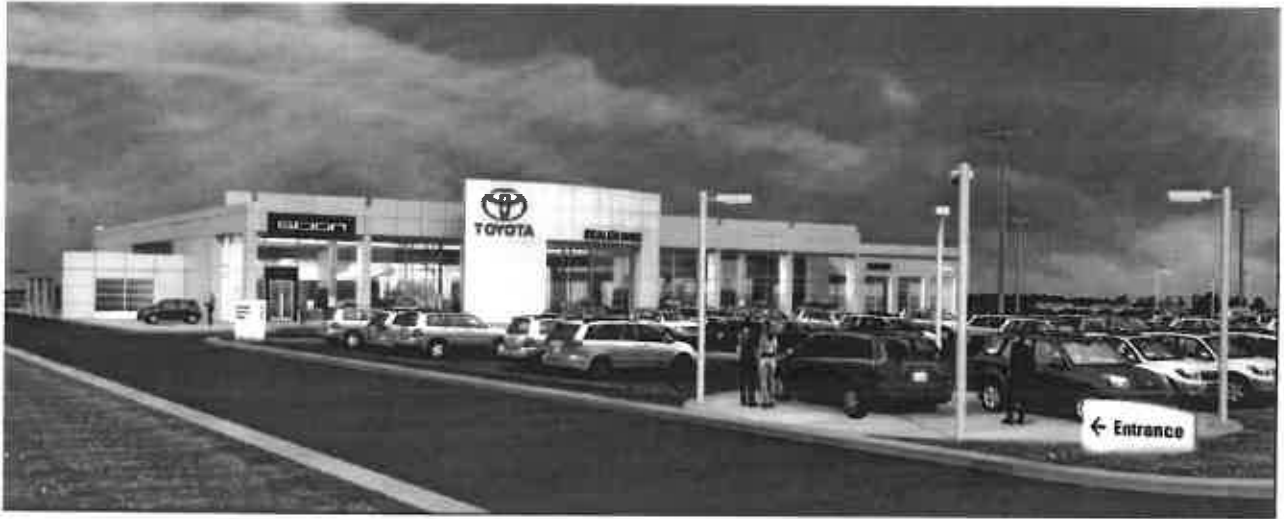
Exterior Facade Renovation