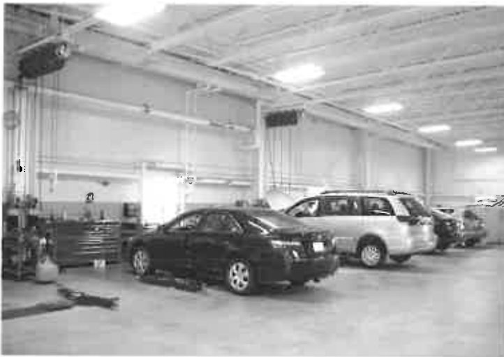
Toyota Service Center