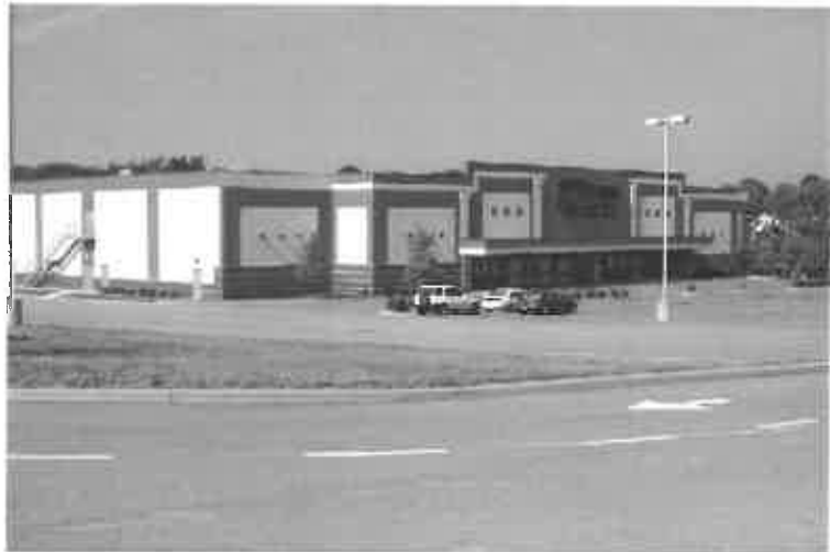
Teays Valley Cinemas

Preliminary Engineering Reports Environmental Reports Preliminary Design Final Design Quantities Cost Estimates Permits Bidding Construction Administration Resident Project Representation (Inspection) Post Construction