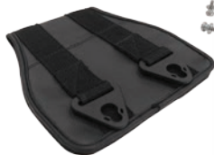
Velcro Belt Loop 258302-001