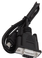
USB to RS232 Adapter 258238-001