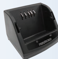
Single Bay Battery External Charger* 258314-001 Americas 258314-002 Europe 258314-003 United Kingdom