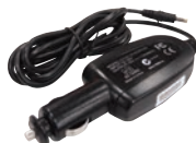
Vehicle Power Adapter 258240-001