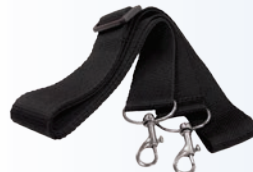
Shoulder Strap 258239-001