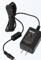
AC Single-Unit Charger* 258233-001 Americas 258233-002 Europe 258233-003 United Kingdom