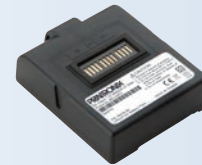
Lithium-Ion Battery 258235-001