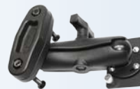
Forklift Mount Kit 258290-001