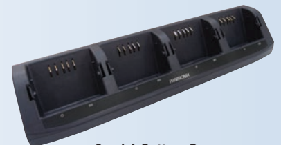
Quad 4-Battery Bay External Charger* 258234-001 Americas 258234-002 Europe 258234-003 United Kingdom

* M4L2 Mobile Printer does not come with power charger.