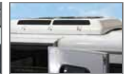
Rooftop Mounted AC