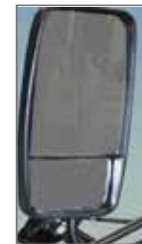
Breakaway Convex Mirrors