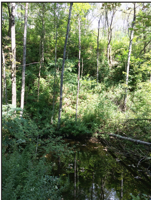
Highwall and Ponding Area

Assist the WVDEP with requests for information, engineering during construction, and/or progress meetings as required or requested.