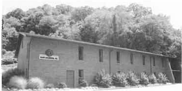
Dunn Engineers, Inc. is located directly across the Kanawha River from the West Virginia State Capitol Complex.

Dunn Engineers, Inc. is a West Virginia based consulting engineering firm that was established in 1975. Since its formation, our firm has been involved in a wide variety of municipal projects, which have enabled our personnel to obtain the breadth and depth of experience needed to meet and exceed the expectations of our clients. Dunn Engineers, Inc. is ready to provide the West Virginia Department of Natural Resources (DNR) with all engineering expertise required for these projects.