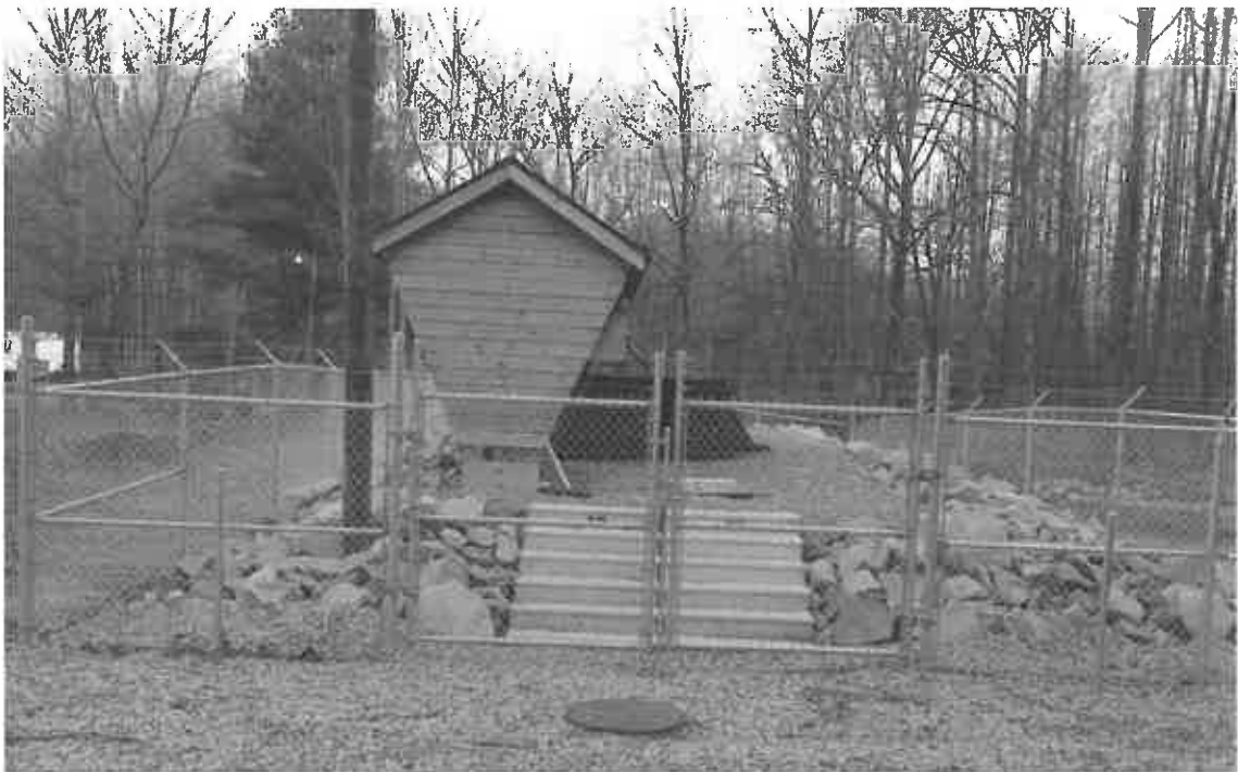
Community of Ury Wastewater Treatment Facility (part of Crab Orchard-MacArthur PSD)

The Community of Ury facility is a small extended aeration package plant (this is a re-circulating sand filter treatment facility), a stand-alone facility capable of meeting all of the requirements of the PSD's NPDES permit. It consists of a 7,500 gallon aeration basin, with a 2,500 gallon digester, 64 square foot clarifier, and 480 gallon sump / chlorine tank; the sludge is hauled to a separate treatment facility in the PSD for dewatering and disposal. Components of the plant include influent and effluent (dosing pump stations along with force main, a subsurface effluent distribution system, and new collection system. The drip field associated with the package plant has a loading area of 215 feet long by 90 feet wide (18,900 square feet), that is dosed at a rate of 0.13 gallons per square foot per day. The drip field is designed for an average flow of 3,750 gpd and a peak flow of 7,500 gpd.