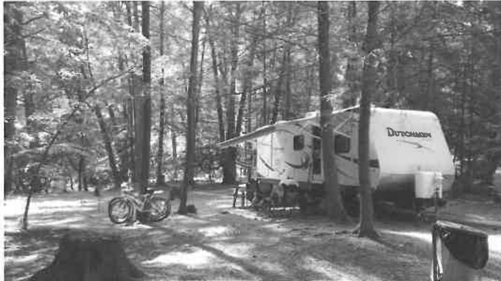
Riverside Campground at Watoga State Park