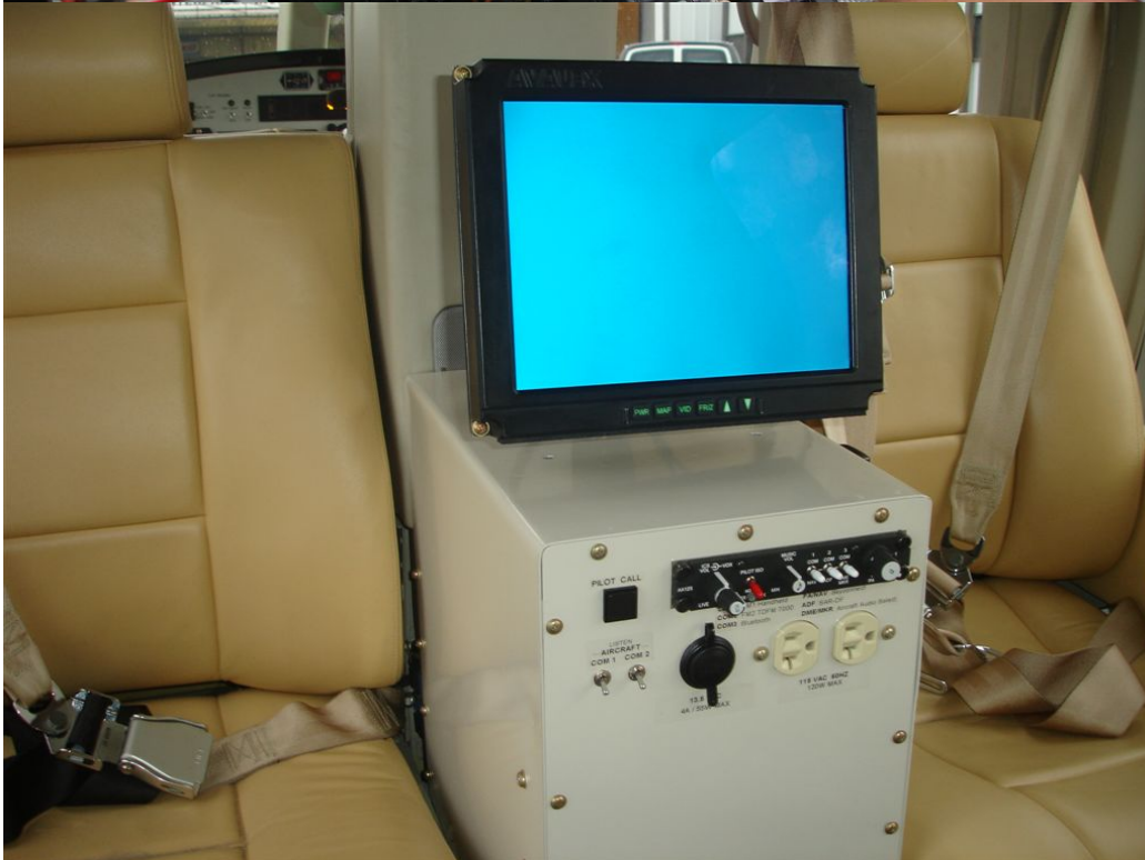
New York City Dept. of Environmental Protection Police Bell 407