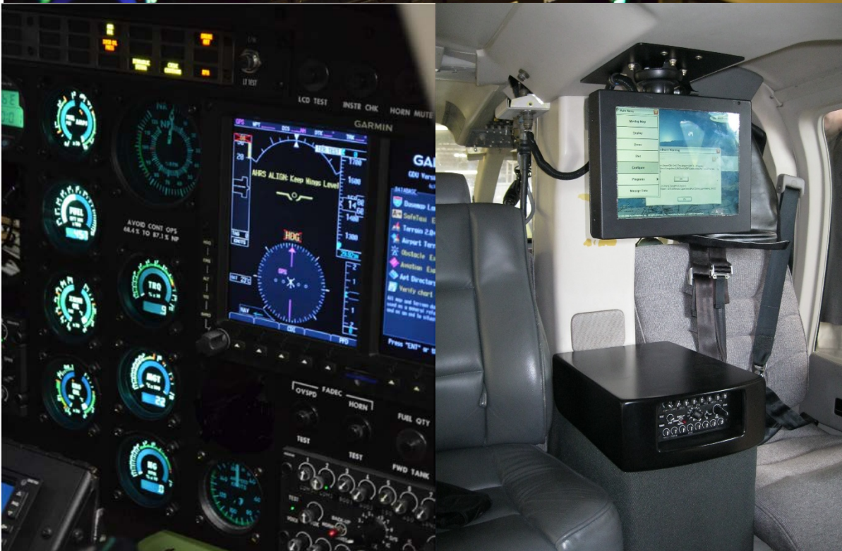
Charlotte Police Dept. Bell 407