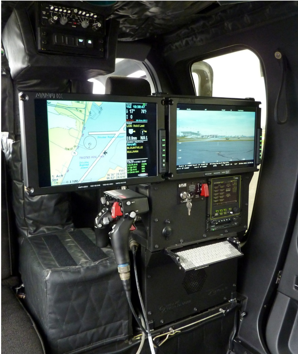
Wysong Custom Mission Equipment Console Bell 407