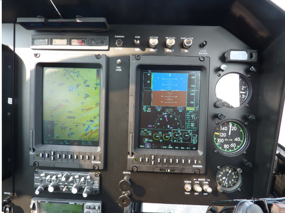
Osceola County Sheriff OH 58