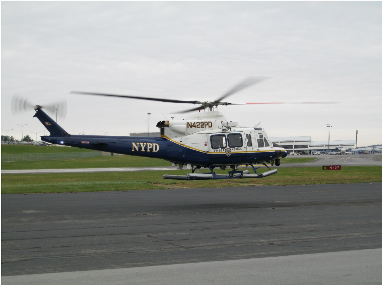
New York Police Department Bell 412 Video Downlink Integration 2012-2013