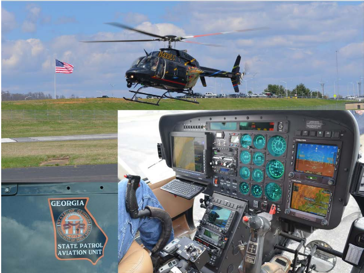
Georgia State Patrol 2014