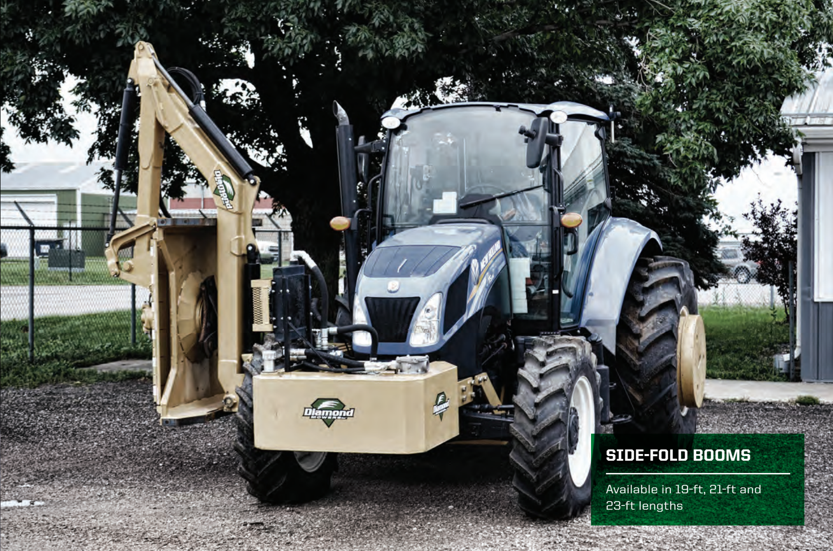
SIDE-FOLD BOOMS Available in 19-ft, 21-ft and 23-ft lengths