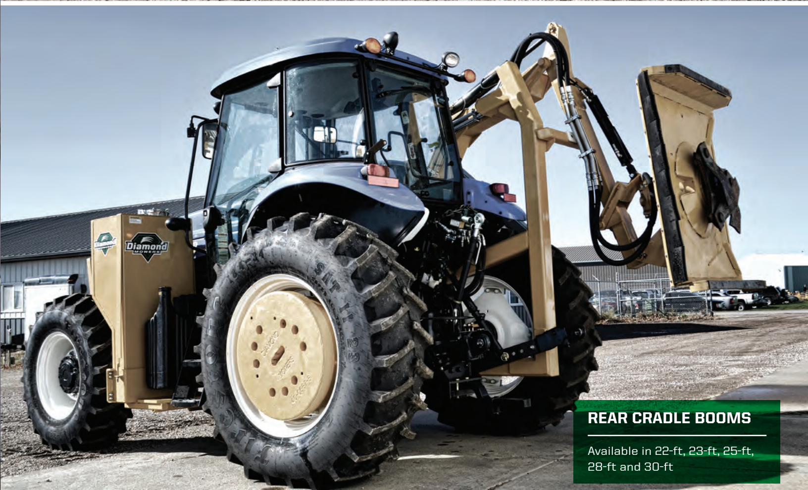
REAR CRADLE BOOMS Available in 22-ft, 23-ft, 25-ft, 28-ft and 30-ft