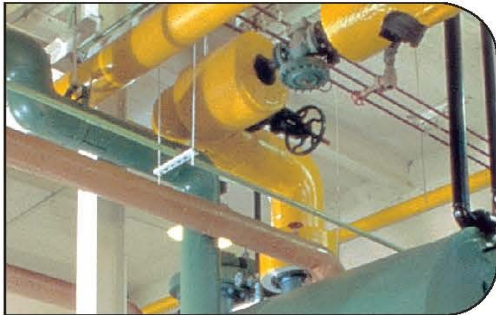
(top) Split Rock Pools—Snowshoe, WV Piping & Pump Room