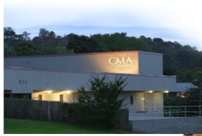
824 Cross Lanes Dr. Charleston, WV