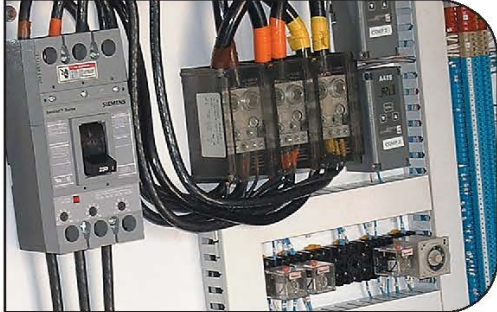
(above) Split Rock Pools—Snowshoe, WV Indirect Lighting System