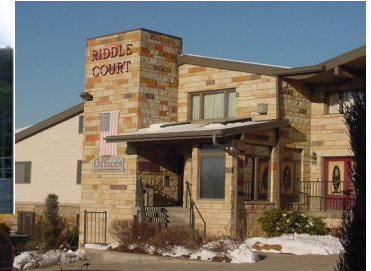
5 Riddle Court, Morgantown, WV