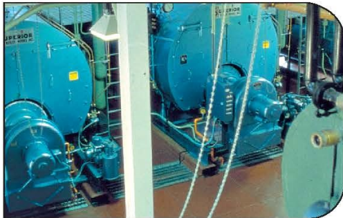
(top) Ruby Memorial Hospital—Morgantown, WV HVAC Exhaust System