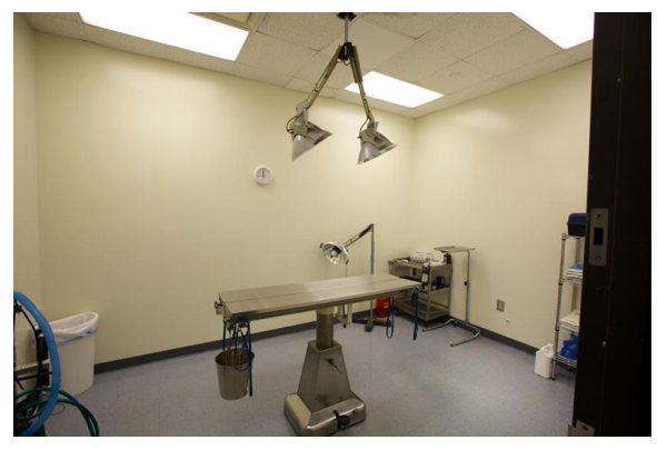
Figure 3-1: Veterinarian Facilities at AMK9 Academy

Once we have identified the canines that possess the desired demeanor, drive and trainability, through the use of the above prescreening assessments and drills, a medical prescreening by a licensed veterinarian is performed on each canine to ensure that each canine selected meets or exceeds the medical standards required. The medical prescreening includes a review of the canine's health records and x-rays to ensure the canine is free of disease and has been properly immunized, and a physical examination of the canine for the following: