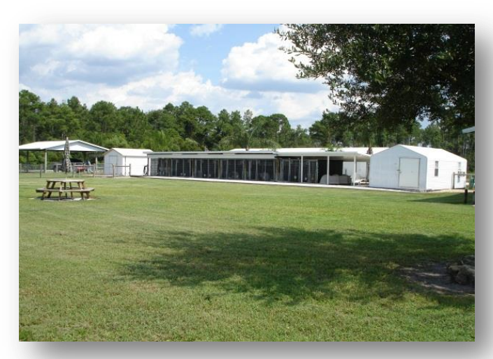
Figure 1-3: SCK9 Training Facility Kennels