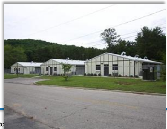
ITC Capital Partners

Use or Disclosure of data contained on this sheet is subject to