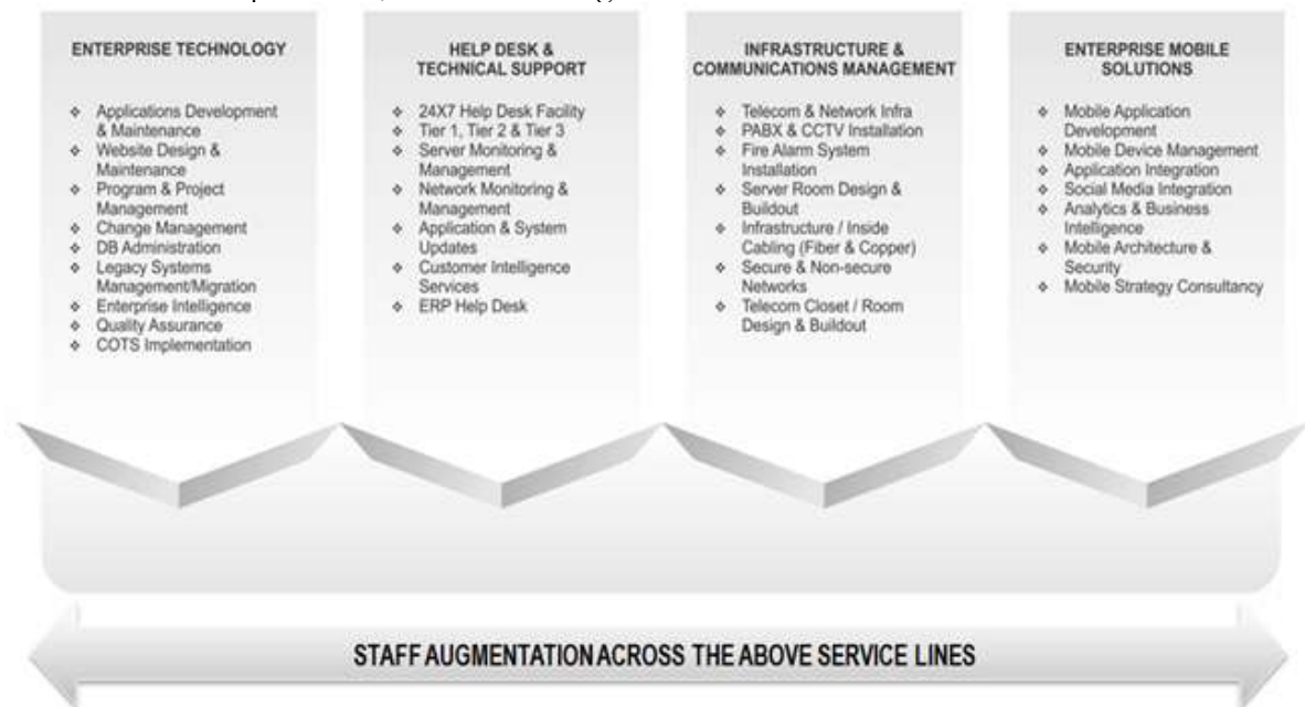
Figure 1: Powersolv's Core Competencies and Expertise

Powersolv (www.powersolv.com) incorporated in 1995 is a Small, and Minority-owned Business (SWaM) certified by the Virginia Department of Minority Business Enterprise (DMBE), an MDOT certified Minority Owned Business Enterprise, a certified Small Business Reserve in the State of Maryland, Minority Business Enterprise (MBE) with the City of Philadelphia, PA and a certified Small Disadvantaged Business. We are an IT staffing augmentation and systems integration services provider located in the Washington D.C. Metro region and possess twenty (20) years of extensive experience in providing consulting & technical services to various State, Local and Federal government clients. We provide services on strategic initiatives and optimal Technology Solutions to various State, Local and Federal Government clients through our CMMI Level 3 and ISO 9001:2008 certified processes, in the following areas: