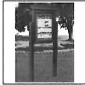
Medium Vertical Message Centers