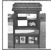
Engraved Message Center Roof Topper