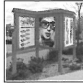
Double-Sided Zig-Zag Message Center