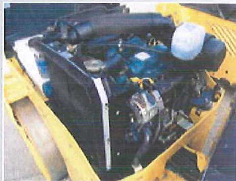
Easy access to engine and drive components for simplified servicing