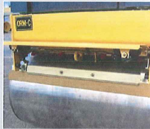
Wind protected, quick-disconnect spray nozzles with dual scrapers per drum.