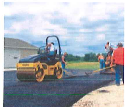
BW120AD-4 shown with optional folding ROPS.