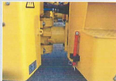
Bolt-on, maintenance free, center-joint with standard crab steer off-set, provides long life and ease of repair.