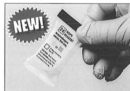
A positive color reaction for MDPV "Bath Salts".