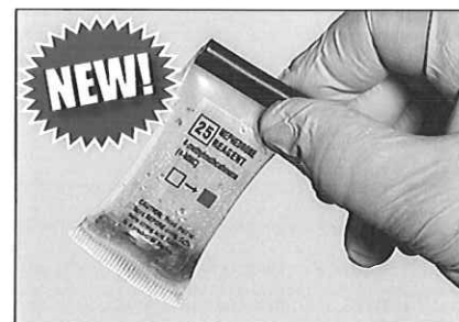
A positive color reaction for Mephedrone "Bath Salts".