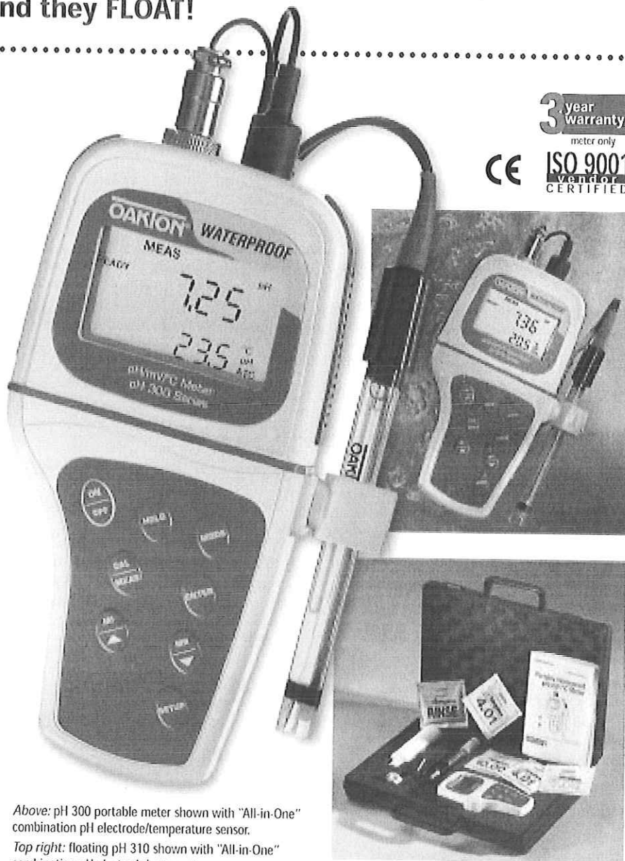
Above: pH 300 portable meter shown with "All-in-One" combination pH electrode/temperature sensor.

DIN: 1.09, 2.06, 4.65, 6.79, 9.23, 12.75