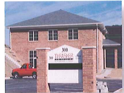
Thrasher Environmental, Inc. Office – Charleston, WV