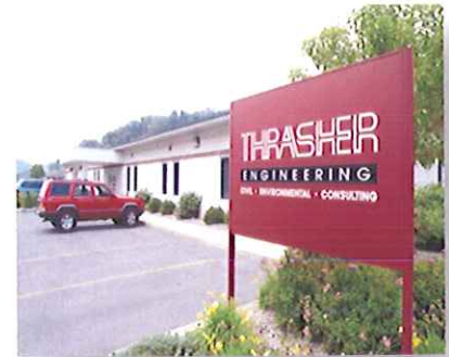
Thrasher Engineering, Inc. Office – Clarksburg, WV

Offices 30 Columbia Boulevard, Clarksburg, WV 300 Association Drive, Charleston, WV 3000 Thayer Center, Oakland, MD 380 Airport Circle, Beckley, WV – Lab & Field Office Princeton, WV – Pentree, Incorporated – Affiliate