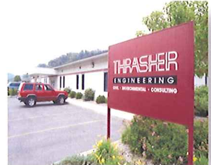
Thrasher Engineering, Inc. Office – Clarksburg, WV

30 Columbia Boulevard, Clarksburg, WV 300 Association Drive, Charleston, WV 3000 Thayer Center, Oakland, MD 380 Airport Circle, Beckley, WV – Lab & Field Office Princeton, WV – Pentree, Incorporated – Affiliate