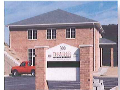
Thrasher Environmental, Inc. Office – Charleston, WV