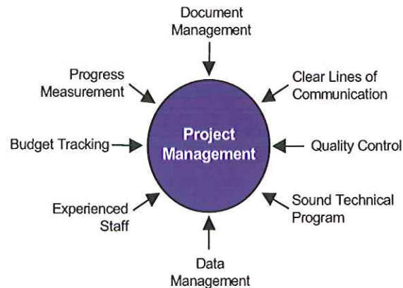
Elements of successful project management.

To ensure the proper application of specialized engineering expertise for all clients, the firm makes use of its quality management procedures that includes creating a Technical Advisory Group. The quality management procedures provide for the preliminary and final review of all concepts, contract plans, layouts, and project reports, and provide for the issuing of internal memoranda which concern developing technologies. These procedures provide for the most up-to-date technical information from inside and outside the firm, and the maintenance of technical files for new products, processes, and construction techniques. In addition, these procedures provide for the involvement of specialists, as needed, to participate in the review of extraordinary or particularly challenging projects.