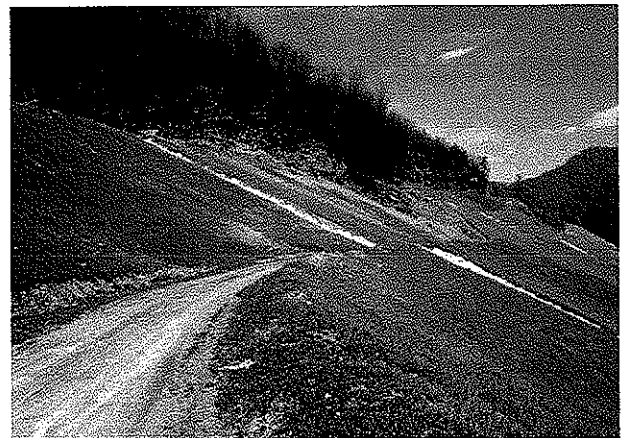
RECLAIMED NORTH REFUSE AREA