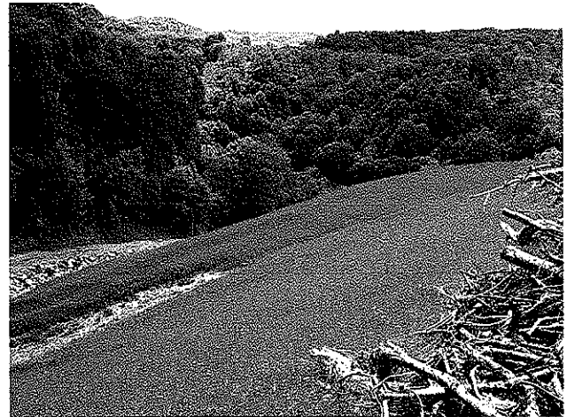
RECLAIMED PILE – VIEW FROM ROAD AT TOP OF PILE