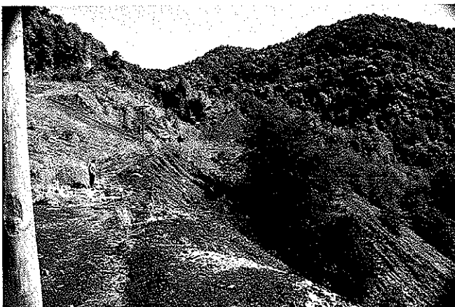
ORIGINAL NORTH REFUSE AREA

Site work also included rerouting a couple of access roads, graveling the roads, culvert installation, and cleanout of existing culverts.