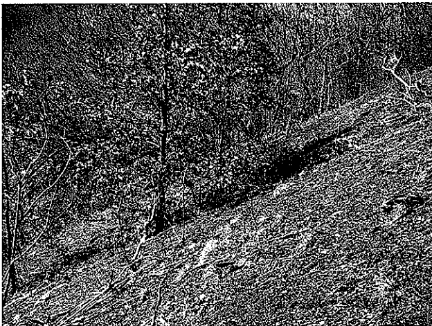
ORIGINAL PILE – VIEW FROM ROAD AT TOP OF PILE

The refuse pile was graded to provide stable slopes with benches every 50' in elevation. The pile was then topsoiled and revegetated. Wet seals were installed in the draining portals, with the outlets directed to the new main riprap channel.