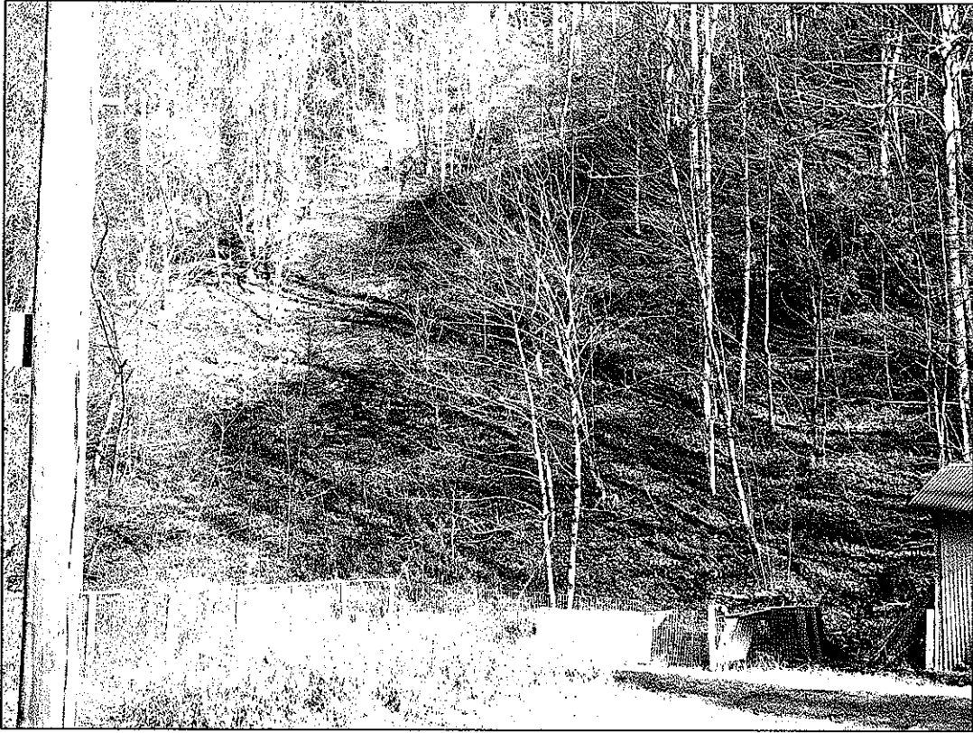
VIEW OF REFUSE FROM SAWMILL HOLLOW ROAD