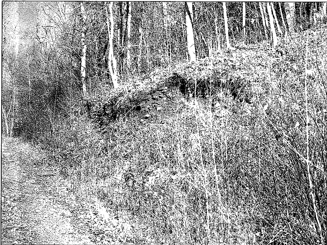
SLIP AREA NEAR BEGINNING OF PILE AT START OF SAWMILL HOLLOW