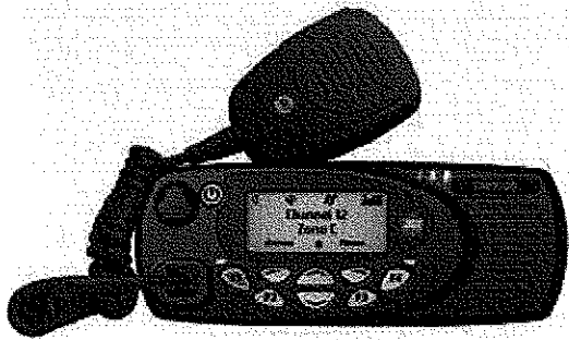
TM9135 P25 Mobile radio shown with standard microphone