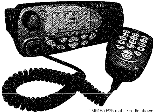
TM9155 P25 mobile radio shown with optional keypad microphone.