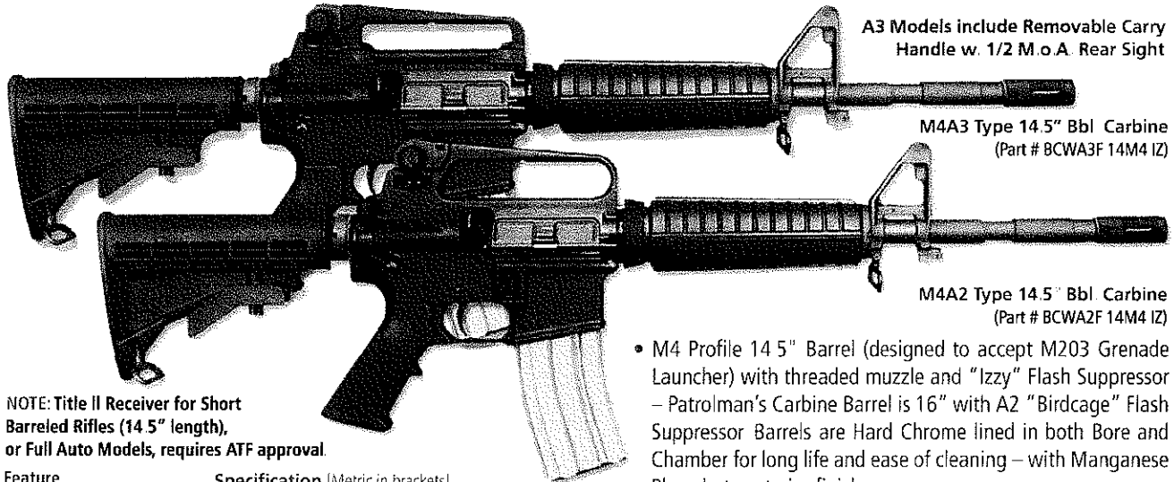
A3 Models include Removable Carry Handle w. 1/2 M.o.A. Rear Sight

One of the world's most popular Military and Law Enforcement Carbine models, the M4 Type features the distinctive M4 Barrel Profile (M203 compatible) and a Six Position Telestock for ease of deployment.