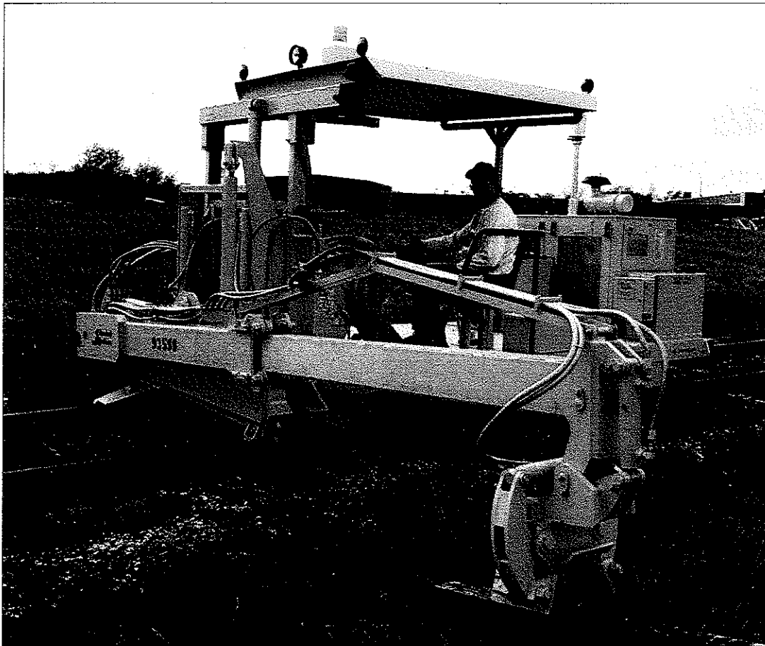
Model 925SS Tie Remover/Inserter, Single Stroke