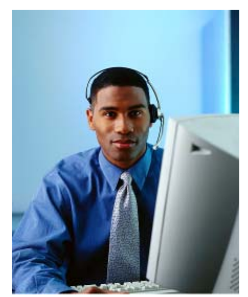
Unisys is one of the 22 preferred vendors selected for the statewide contract for technical temporary personnel. For a complete list of preferred vendors visit www.state.wv.us/admin/purchase/swc/ITECH.htm

Prior to using any statewide contract, agencies are strongly encouraged to check the website for contract provisions that may apply.